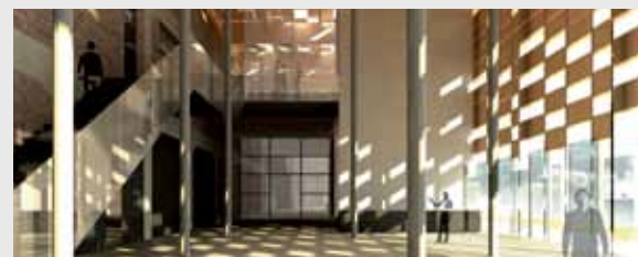
City of Arts and culture