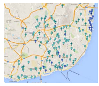
Pilot charging network - Lisbon [14]

The first charging point was installed in Lisbon in June 2010. The first test phase planned to install 1,300 normal charging points in public roads and 50 fast-charging points in primary roads and highways by 2012. However, by May 2012, only 1,098 normal and 8 fast-charging points were installed. MOBI.E was implemented within the "RENER Living Lab", a pilot network encompassing 25 municipalities. Several charging points and other related technologies were tested in urban spaces by large international manufacturers such as Renault, Nissan, Mitsubishi and Peugeot. By March 2016, there were 184 charging points in Lisbon.