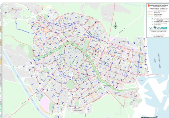
Current Cyclist Network