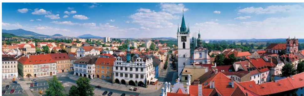
Litomerice city view, Czech Republic. One of 11 INNOVATE partners.

More about the INNOVATE project on: www.financingbuildingrenovation.eu