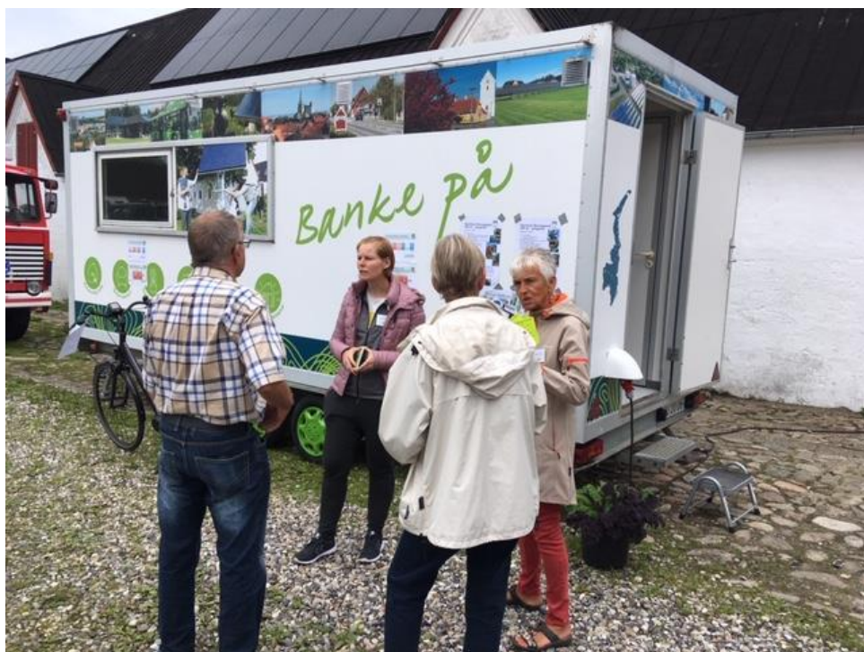
Frederikshavn mobile one-stop-shop, Denmark. One of 11 INNOVATE partners.

Further visual material can be provided for media coverage upon request.