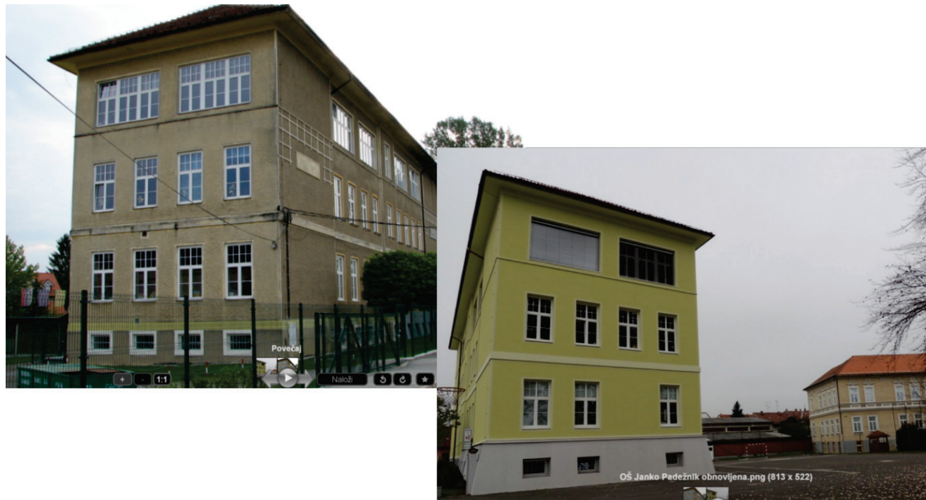
One of the 24 renovated public buildings in the municipality Maribor (primary school)

Koekelberg enhanced their wider capacities by using the existing framework which can link local governments together. They recognised the value of this relationship particularly when collectively engaged in finding financial support for energy saving schemes.