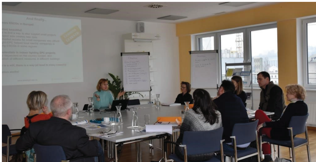
Participants discussing about EPC as an innovative financing scheme