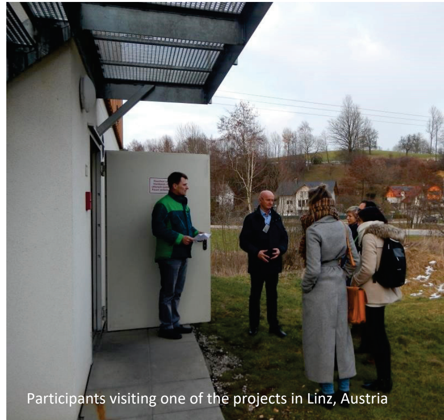
Participants visiting one of the projects in Linz, Austria