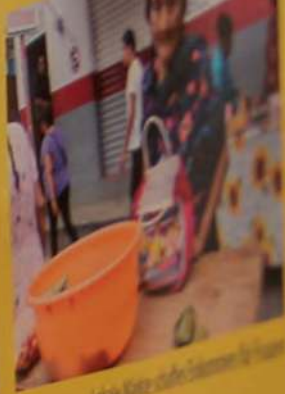
Lokale Märkte stärken Zusammenhalt