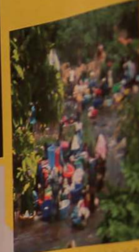
Frauen und Widerstand im Feld

8,1 Millionen Jobs im EE Sektor - für Männer und Frauen? Millionen Arbeitsplätze nach Sektoren (EE) weltweit im Jahr 2015